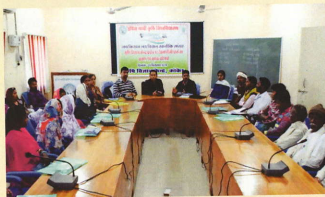
Jai Kisan Jai Vigyan programme at Kanker