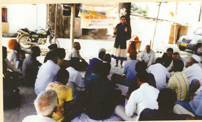
Jai Kisan Jai Vigyan programme at Dewas