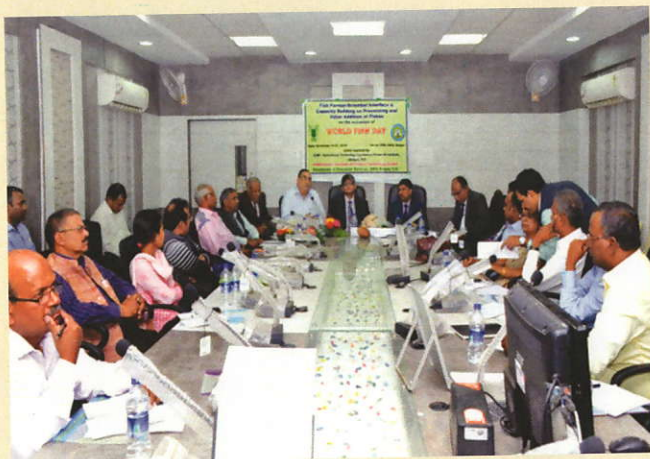
Fish Farmer- Scientists Interface at IGKV, Raipur