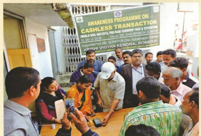
Cashless transaction for agro input by women farmer at Sonepur