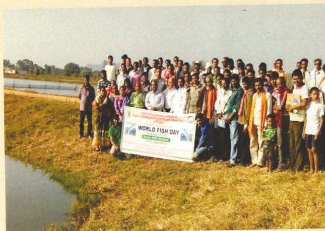
Celebration of the World Fish Day at KVK Dhamtari