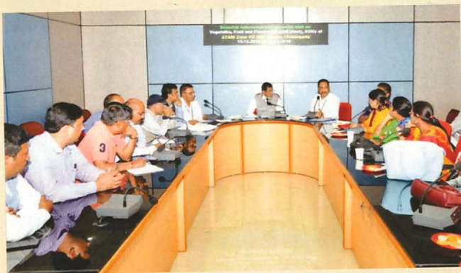
Director IIHR interacting with participants

Capacity building programme of Horticultural Experts from KVKs on Vegetables, Fruits and Flowers from KVK from Zone VII was organized at ICAR-IIHR Bengaluru during December 15-17, 2016. The programme was participated by 25 participants from Madhya Pradesh, Chhattisgarh and Odisha. During the training programme Panel discussions were organised to gain knowledge on Production, Integrated Pest Management, Disease Management, Nutrient Management and Post Harvest Management of selected fruit, vegetable and ornamental crops, farm mechanization in horticulture