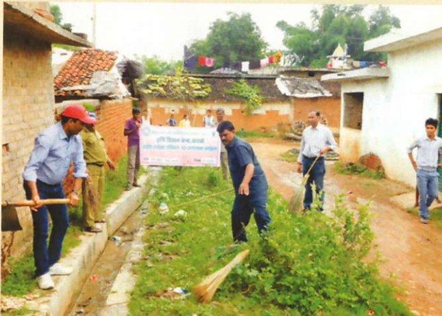
Swacchta Campaign in village by KVK Kawardha