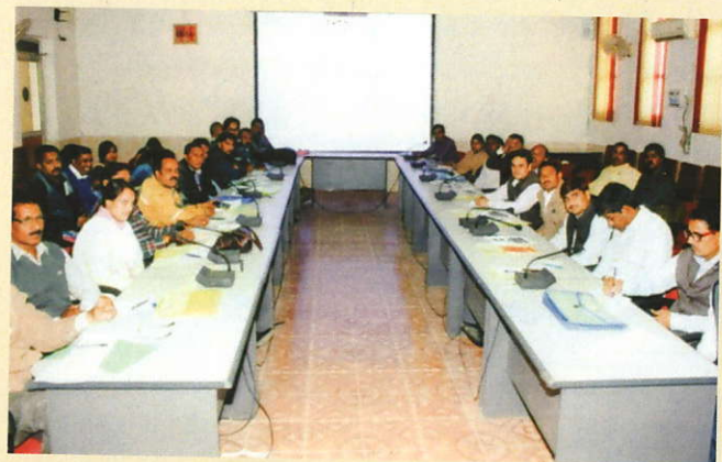
Sensitization Workshop on Warehousing Development and Regulatory Authority at Jabalpur