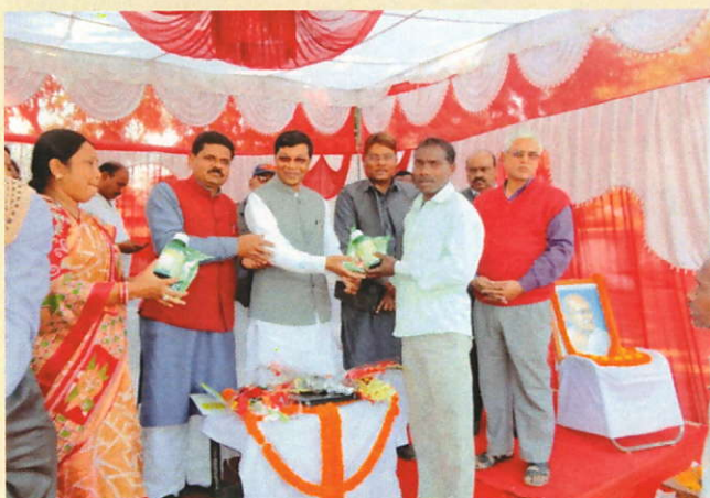
Shri Sudarshan Bhagat Ji, Hon'ble Minister of State for Agriculture & Farmers Welfare at KVK Sundargarh

purchased including pesticides, seeds planting material and farm machinery as well as tractor from input dealers using swap card/ POS machines, aadhaar enabled cashless transaction, ATM/debit card and online payment apps etc. Total 75 KVKs have organised the awareness programme on cashless transaction benefitting 25432 farmers with participation of 249 input dealers.