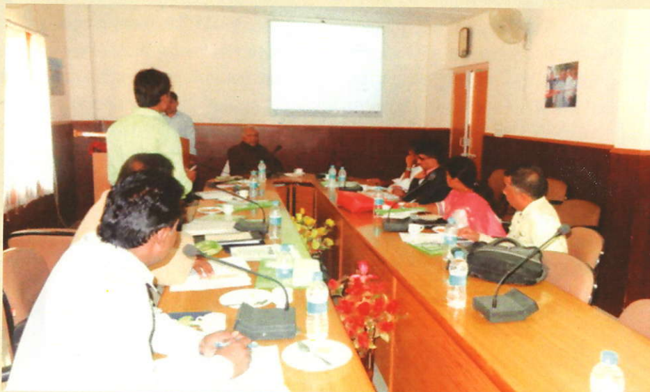
Meeting of Farm Innovation Fund

representative and scientists from ATARI. The project proposals from five KVKs Seoni, Dhamtari, Keonjhar, Bargarh, Dhenkanal were presented by the SMS from the KVKs.