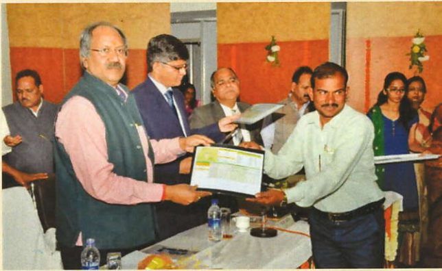
Sh. Brijmohan Agrawal, Minister of Agriculture, Animal Husbandry, Fish Rearing at Raipur