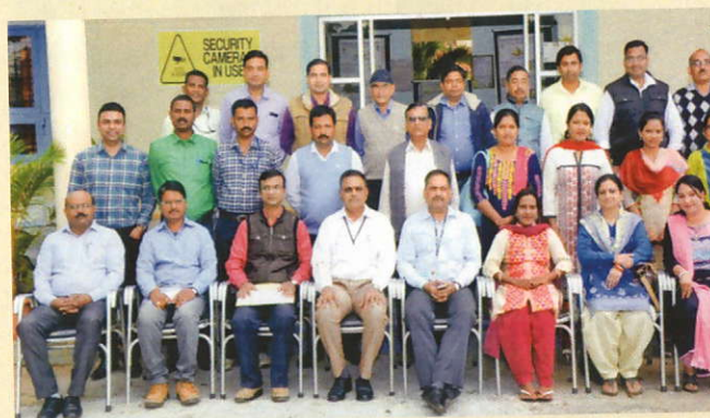
Participants from KVKs of ATARI, Jabalpur in Training at IIHR