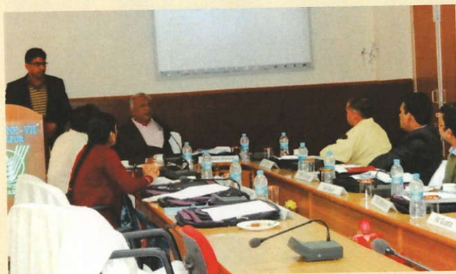
Sixth Institute Management Committee Meeting of ICAR-ATARI, Jabalpur

reports of the current projects and new project presentation were done by scientists. Various administrative and financial matters were discussed during the meeting.