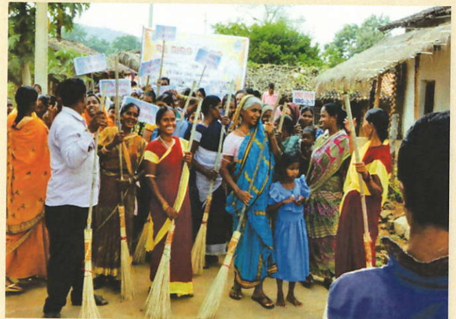
Awareness about cleliness invloving Anganwadi workers by KVK Kalahandi