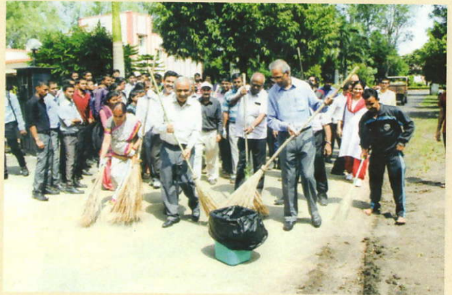
Swacchta Campaign at ICAR-ATARI, Jabalpur