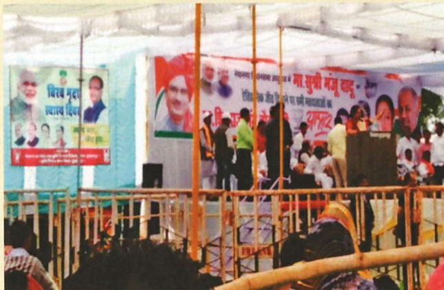
Smt. Archana Chitnis Minister of Women and Child Development at Burhanpur