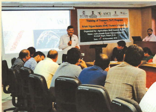
Orientation programme on skill development training for KVK trainers at IGKV Raipur