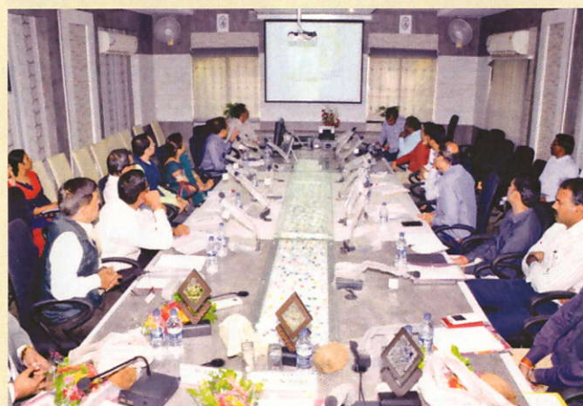
Orientation Workshop of Farmer FIRST Programme at IGKV Raipur