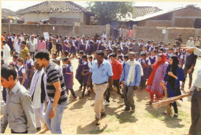
Swacchta Awareness rally in Village Lokhkari by ATARI and KVK Jabalpur